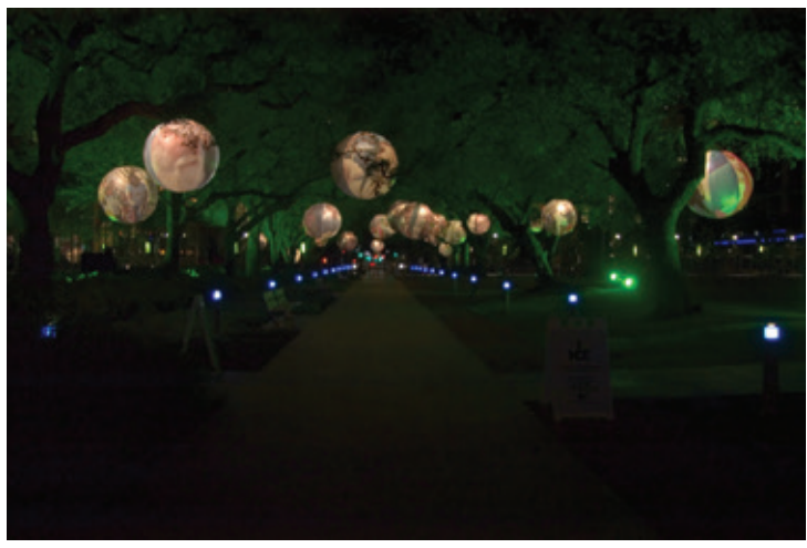
David Graeve, public space balloon installation at Discovery Green Park, 2011

"Lens - Pluralism – Bubbles" at Disvocery Green Park