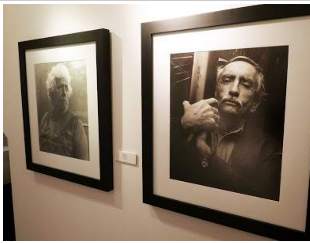
Edward Albee, 1999 Playwright