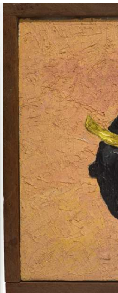
Forrest Bess' "#10," 1950