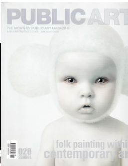
Magazine covers featuring artworks by Oleg Dou