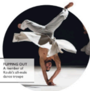
FIPPING OUT A member of Koubi's all-male dance troupe