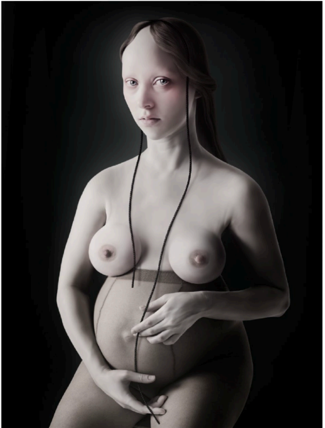
Pregnant, C-print face mounted with acrylic, Edition 1/8, 83 x 47 inches