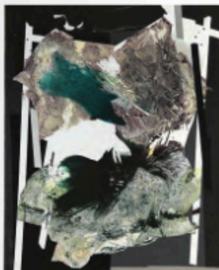
Sigrid Sandström Untitled , Acrylic on polyester canvas, 76" x 60"

Oleg is interested in the areas where beauty and sadness come into conflict—he has said that he wants his work to be something "bordering between the beautiful and the repulsive, living and dead." This will be the artist's first solo exhibition in Houston. Exhibition in view during FotoFest throughout March 2016.