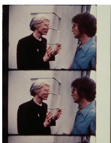
Jonas Mekas: 21, OUTPOST NYC DCG, Frozen Film Frames, 2010 Edition 1/8, 23" x 18"

This year, in between travels to many European countries, Jonas Mekas presented his contribution to My First New York book published by Harper Collins (other contributors include Yogi Berra, Liza Minnelli, Chloe Sevigny, Andy Samberg and Diane Von Furstenberg). The book is a collection of reminiscences by fifty of the city's most famous residents who recapture the thrills of arriving in New York. Also this year, Jonas Mekas launched his new diary-website - www.jonasmekasfilms.com - in which we can see glimpses from his daily life, explorations and travels.