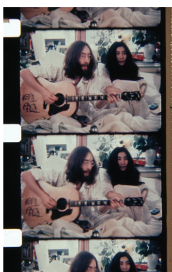
Jonas Mekas: 12, OUTPOST NYC DCG, Frozen Film Frames, 2010 Edition 1/9, 28" x 18"