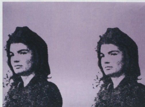
Andy Warhol's Jackie II , 1966, at Hiram Butler Gallery