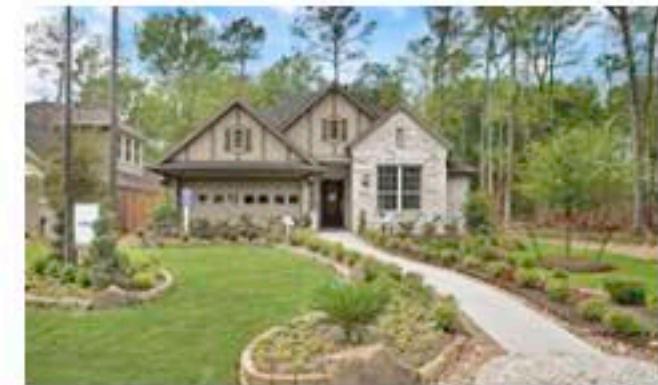
LENNAR FROM THE $260S