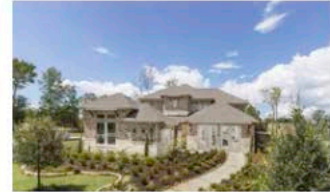
VILLAGE BUILDERS FROM THE $340S