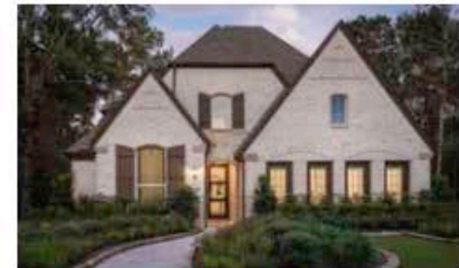
HIGHLAND HOMES FROM THE $340S