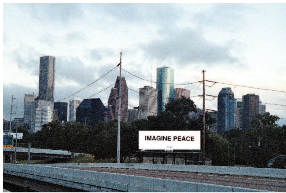
Yoko Ono IMAGINE PEACE billboard from Deborah Colton Gallery, 2006 WORD exhibition.