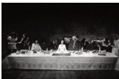
Ultra Violet, still from The Last Supper , 1972

This performance and film—a re-enactment of the Biblical Last Supper—was conceived for The Kitchen in 1972 and performed by New York-based artists under the influence of feminism.